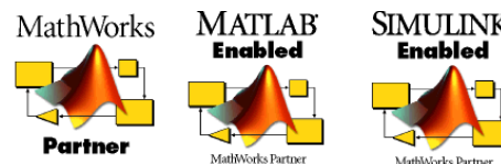
Old partner logos

The older Connections Program partner logos (shown at right) are no longer to be used. Please replace them with the new badges found on the new Connections Resource Portal as soon as is feasible. We recognize that any printed collateral may take time to be updated. We ask that you update those at the next opportunity available.